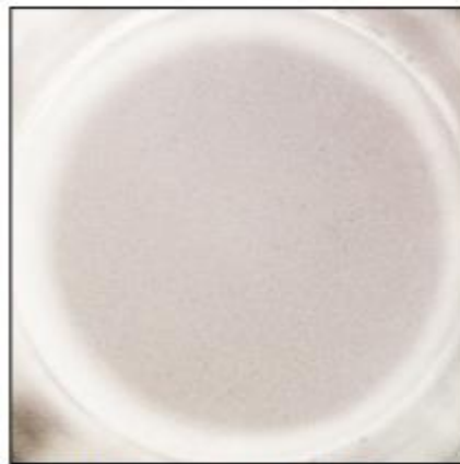
Stimulus: none ( 2 \times 10^5 cells/well)