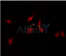
AF3399 staining NIH-3T3 by IF/ICC. The sample were fixed with PFA and permeabilized in 0.1% Triton X-100, then blocked in 10% serum for 45 minutes at 25°C. The primary Ab was diluted at 1/200 and incubated with the sample for 1 hour at 37°C. An Alexa Fluor 594 conjugated goat anti-rabbit IgG (H+L) Ab, diluted at 1/600, was used as the secondary Ab.

IMPORTANT: For western blot, incubate membrane with diluted primary Ab in 5% w/v milk, 1X TBS, 0.1% Tween@20 at 4°C with gentle shaking, overnight.