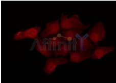
AF0833 staining JK by IF/ICC. The sample were fixed with PFA and permeabilized in 0.1% Triton X-100, then blocked in 10% serum for 45 minutes at 25°C. The primary Ab was diluted at 1/200 and incubated with the sample for 1 hour at 37°C. An Alexa Fluor 594 conjugated goat anti-rabbit IgG (H+L) Ab, diluted at 1/600, was used as the secondary Ab.

IMPORTANT: For western blot, incubate membrane with diluted primary Ab in 5% w/v milk, 1X TBS, 0.1% Tween@20 at 4°C with gentle shaking, overnight.