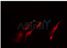
AF0132 staining K562 by IF/ICC. The sample were fixed with PFA and permeabilized in 0.1% Triton X-100, then blocked in 10% serum for 45 minutes at 25°C. The primary Ab was diluted at 1/200 and incubated with the sample for 1 hour at 37°C. An Alexa Fluor 594 conjugated goat anti-rabbit IgG (H+L) Ab, diluted at 1/600, was used as the secondary Ab.

IMPORTANT: For western blot, incubate membrane with diluted primary Ab in 5% w/v milk, 1X TBS, 0.1% Tween@20 at 4°C with gentle shaking, overnight.