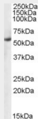
AF1877a (0.1 µg/ml) staining of Human Ovary lysate (35 µg protein in RIPA buffer). Primary incubation was 1 hour. Detected by chemiluminescence.