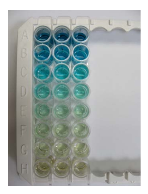
Figure 1: Urea Assay Standard Curve. Typical color visualization of standards generated using the Cell Biolabs Urea Assay Kit.

The following figures demonstrate typical Urea Assay results. One should use the data below for reference only. This data should not be used to interpret actual sample results.